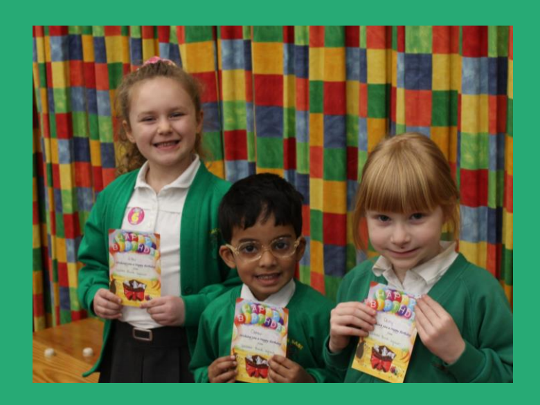
Congratulations to these children!