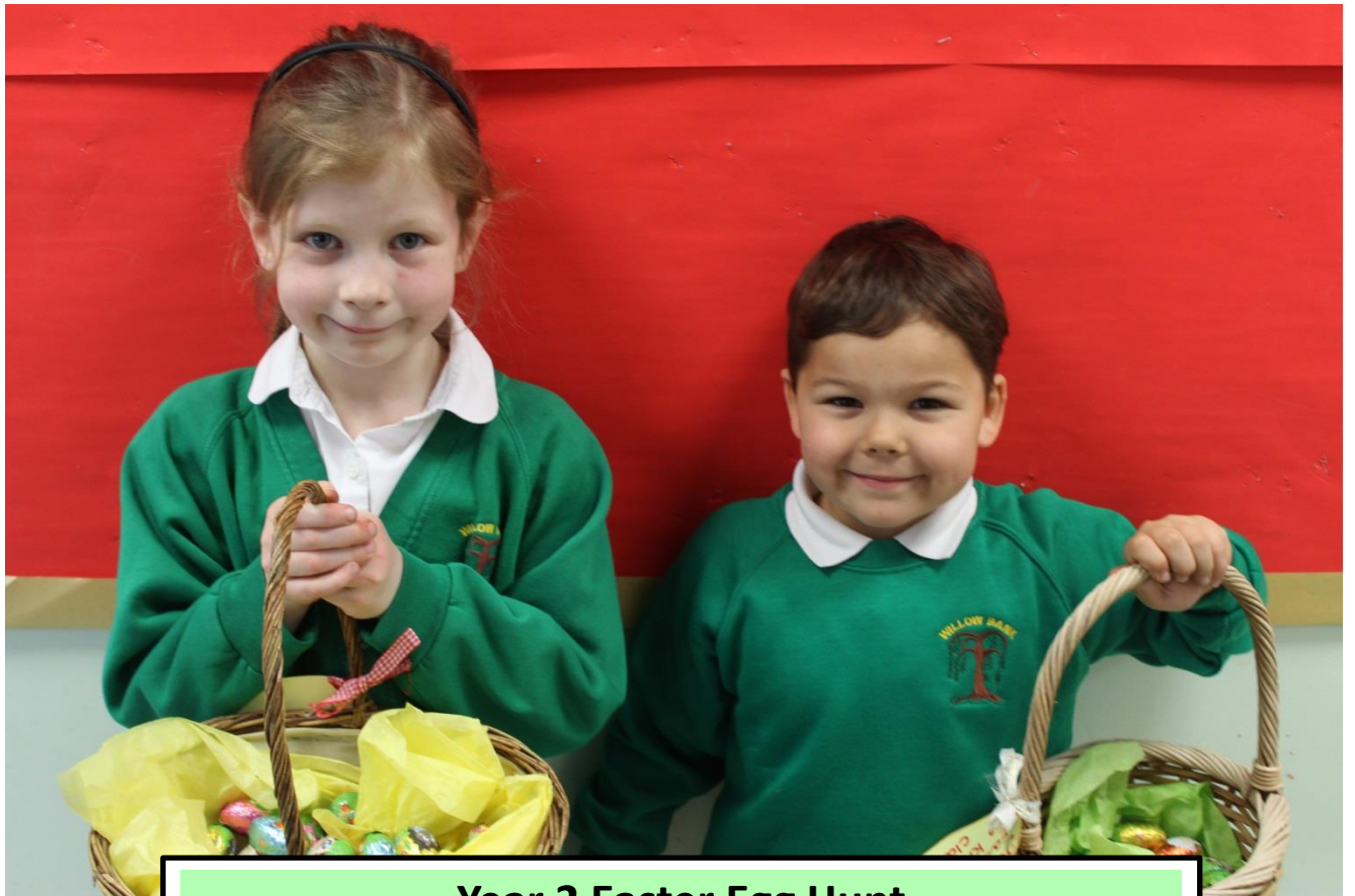
Year 2 Easter Egg Hunt