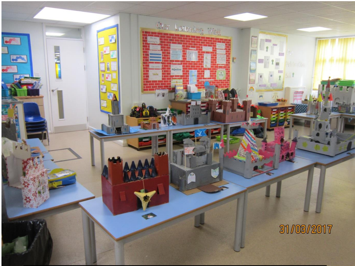
Year 1 Castles