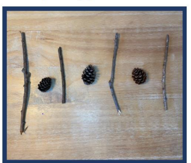
See how many different patterns you can make.