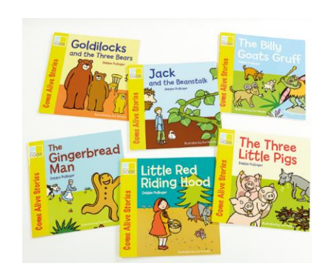
Summer Term 2 Week 1 Bulletin