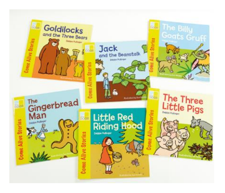
Summer Term 1 Bulletin 6<sup>th</sup> May 2022 Topic: Traditional Tales