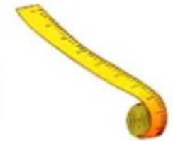
a measuring tape