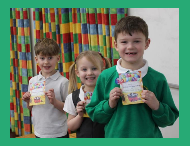
Congratulations to these children!