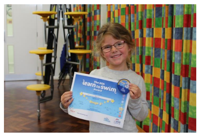
Congratulations on your achievement!

If you need to get in touch with the PTA please email us at <a href="wbis.pta@hotmail.com">wbis.pta@hotmail.com</a>. Like our Facebook page Willow Bank Infant School PTA to keep up to date with all our latest events and news.