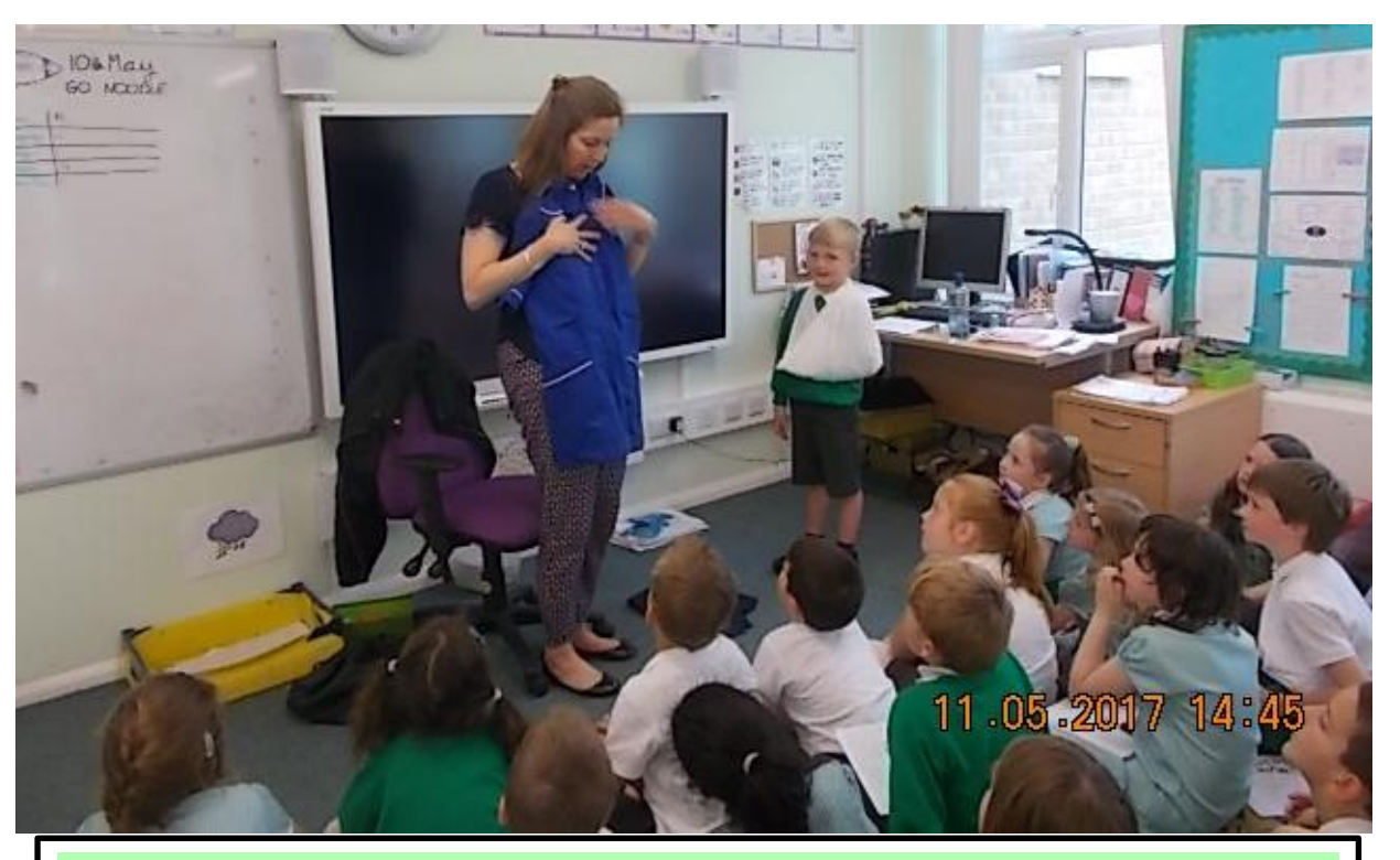
Year 2 History- Nurses 'then' and 'now'