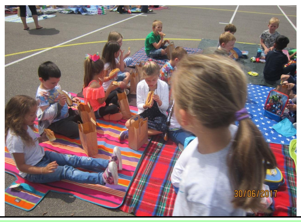
The children enjoyed the inter-school picnic with the Juniors!