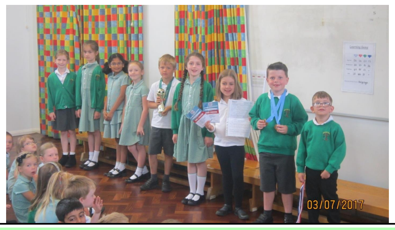
Congratulations to these children for their achievements!