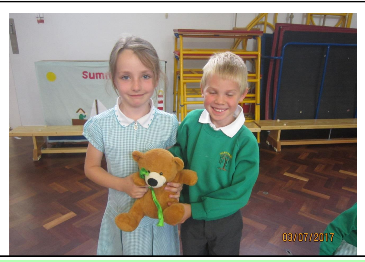
Well done Owl Class for winning Gem Bear!