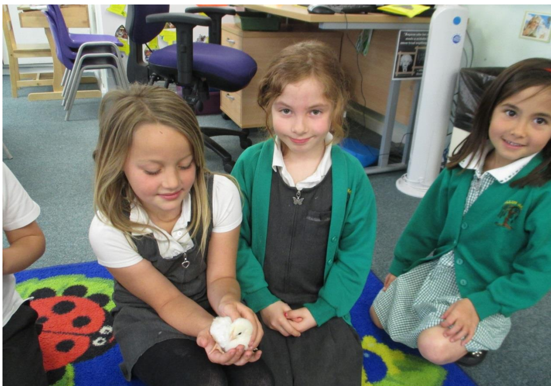
Year 2 Holding the chicks